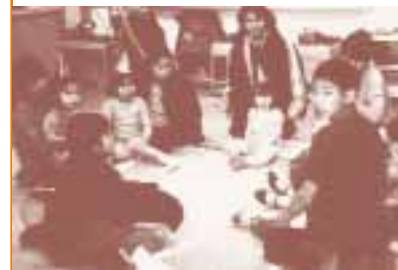
SNACK TIME AT YEKOOCHE HEAD START

We are focusing on decreasing delays in development, increasing awareness of child development best practices, raising awareness about FAS, decreasing behavioral challenges in children and preventing child abuse and neglect.